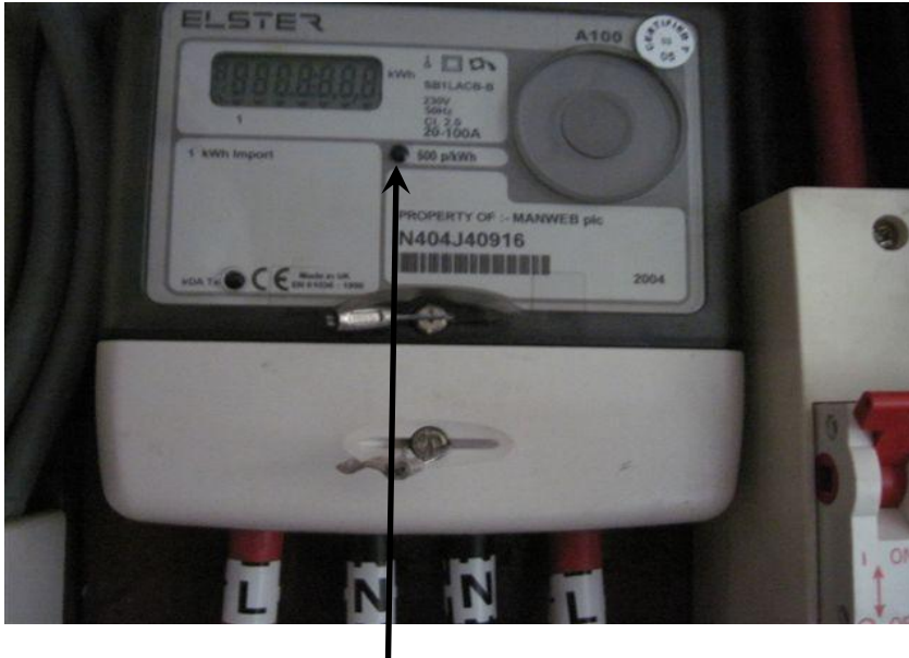
OptiSmart meter location